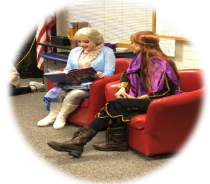
Story time with Elsa and Ana at the bookfair.